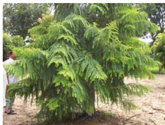
Tree growth after 5 months of heading back