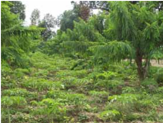
Elephant foot yam as intercrop in the rejuvenated orchards

During initial 2 - 3 years after rejuvenation, aonla groves present an excellent opportunity for utilizing vacant interspaces in the orchard. Vegetables like bottle gourd, okra, cauliflower, coriander and turmeric; flowers like gladiolus and marigold have been found well suited for intercropping in rejuvenated aonla orchards. In salt affected soil or marginal soils, intercropping of Dhaincha for a few years is beneficial for improving the physico-chemical properties of the soil.