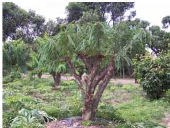
Tree canopy after shoot pruning

removal of unwanted shoots, considering the vigour and growing direction is important. In this technique, only 4 to 6 shoots developing in outer directions on main limbs should be allowed to develop. Proper development of new canopy in horizontal direction should be kept in mind while practicing thinning of shoots. During May-June, the selected shoots are further pruned out to about 50 per cent of its total length for emergence of multiple shoots below the pruning points. This was