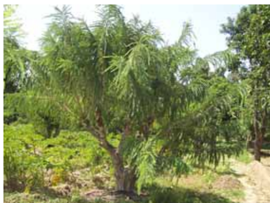
Development of better canopy as a result of shoot pruning

mainly done to modify the tree structure and maintain canopy size. Fruiting starts on third year after rejuvenation. Yield levels during initial year are slightly low, while the yield from third year onward is better than the unpruned trees.