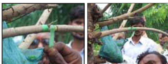
Process of budding technique on beheaded tree