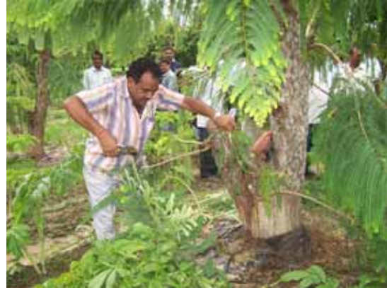
Pruning Shoot (50%) of its total length

The new shoots arise on pruned branches of heading back and a few shoots are retained at proper spacing and growing towards periphery of trees. Successive