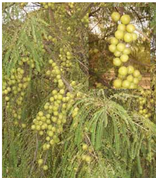
Fruiting on rejuvenated aonla tree

mainly done to modify the tree structure and maintain canopy size. Fruiting starts on third year after rejuvenation. Yield levels during initial year are slightly low, while the yield from third year onward is better than the unpruned trees.