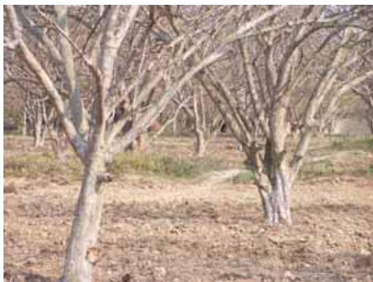
Old and crowded aonla orchard

Canopy development in perennial crops has a seasonal as well as life long developmental pattern. The sum of development over individual season results in the final canopy dimension and form. In general, canopy of aonla has irregular shape. Trees of irregular