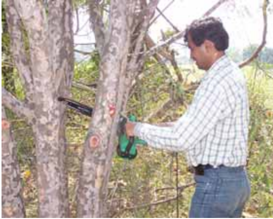
Heading back of branches