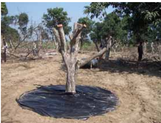
Headed back tree with black plastic film

redevelopment of canopy is necessary in older plantations, when the canopies are overcrowded resulted in reduction in yield. This is possible by hedging of branches followed by shoot management to modify the tree structure and maintain canopy size.