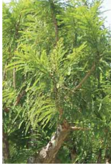
Beheaded branches showing emergence of new shoots

There is a tendency of over lapping of canopy between 10 and 12 years of age depending on the nature of variety unless the canopy is maintained by trimming and thinning. Plantation which have overlapping branches lead to dead wood development decline in yield in later years. Such plantation can be rejuvenated through canopy redevelopment. The