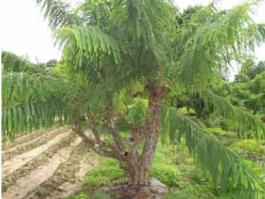
Tree canopy after shoot thinning

The rejuvenation technology involves heading back (topping) of branches during December - January at a height of 2.5 to 3.0 m from the ground level depending on the structure of individual trees in the orchard. Before rejuvenation pruning, branches are marked with white chalk by making a ring around the branches. The selected branches should initially be cut from the under side on the lower side by giving at least 10 cm deep cut. Thereafter, the cutting should be done from the upper surface of the branch. The cut portion of the branches is then pasted with cow dung or copper oxychloride to avoid infection of fungal diseases. Immediately after heading back, the pruned wood needs to be removed from the orchard so as to prevent the damage by trunk borers.