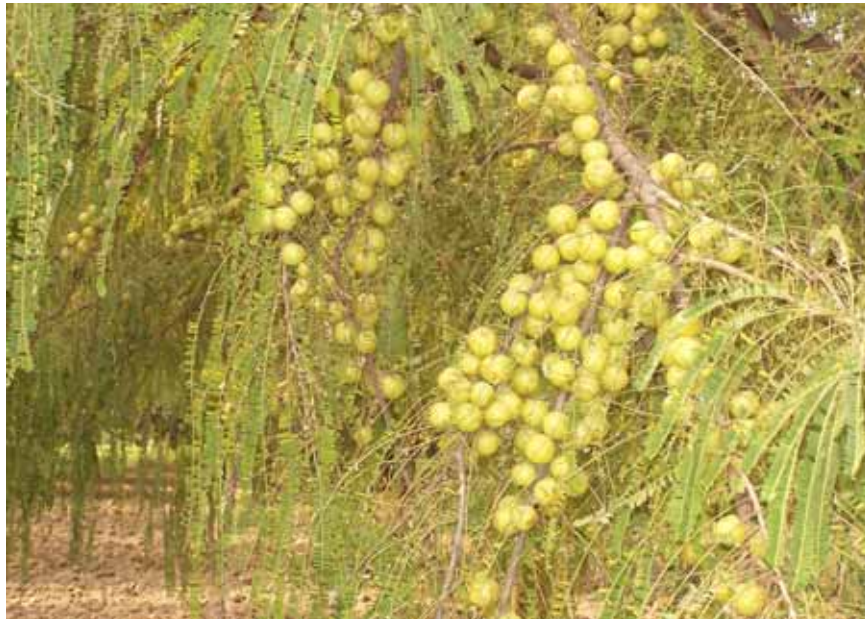
Fruiting on top worked tree

that tree of pure commercial variety is obtained. Since aonla is self incompatible, i.e. the pollens of same tree/variety can not fertilize its own ovary, the production from mono-culture orchards without appropriate polliniser varieties, suffers adversely as a result of problem of fruit set. Consequently, polliniser varieties are budded on developing shoots of pruned trees to strengthen pollination process and enhancement of fruit set and productivity. Budding with mixed varieties results in better yield. The best combination is NA-6 with NA-7; NA-7 with NA-10 and Kanchan with Krishna. Adequate care should be taken to manage the insect-pest problems as these plants are prone to insect and some times wind damage.