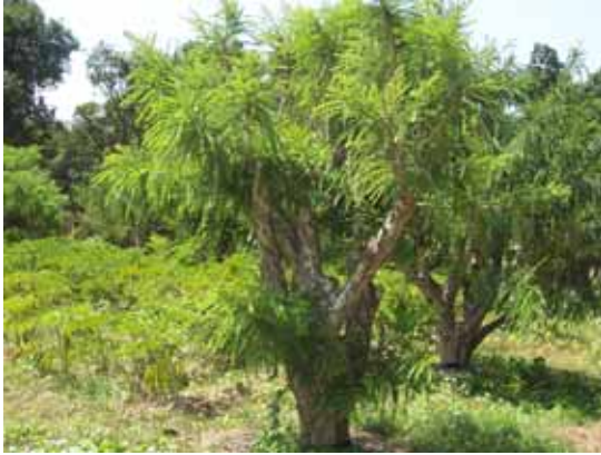
Better canopy after rejuvenation by top working

bud sprouting, the top portion of the shoot is removed. Numerous side shoots, which emerge on the pruned branches after the budding operation should be removed regularly as and when they emerge, so