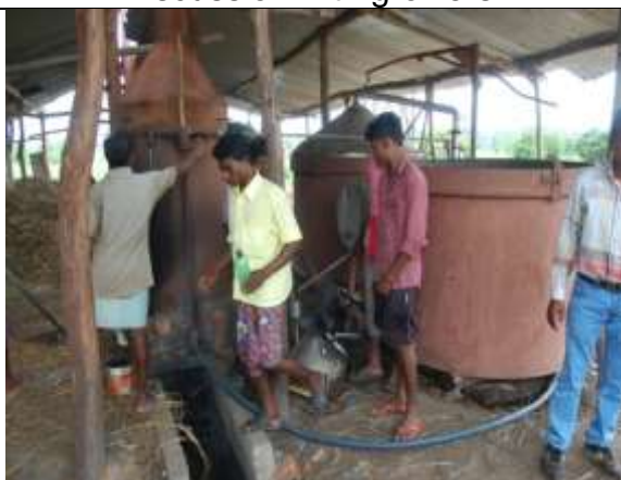
Extracting oil from Jamarosa