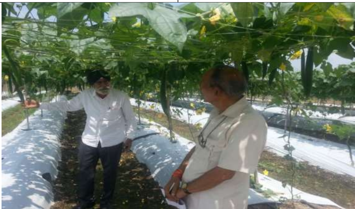
Ridge gourd cultivation with plastic mulching