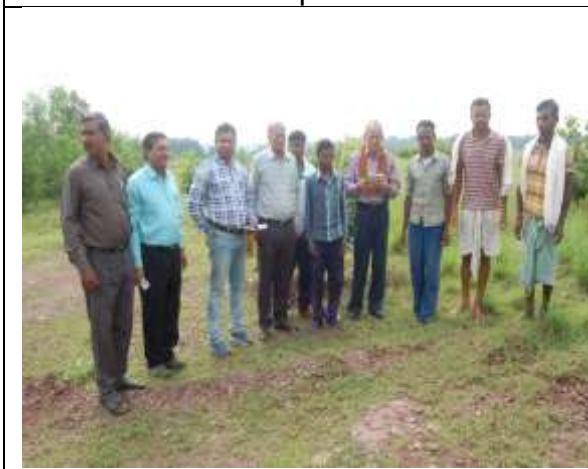
Discussion with beneficiaries