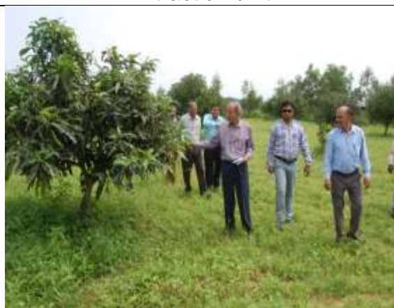
Team inspecting mango