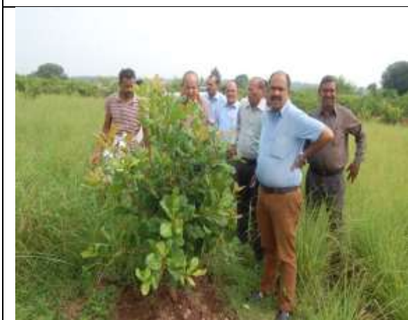
Close up of cashew nut plant