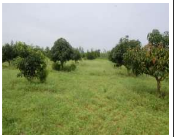
Mango intercrop with Urd