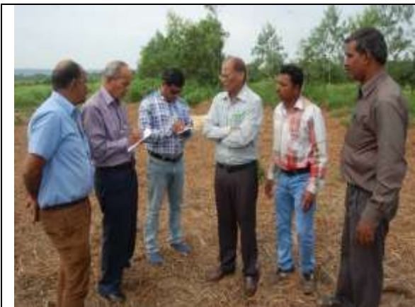
Discussion with growers