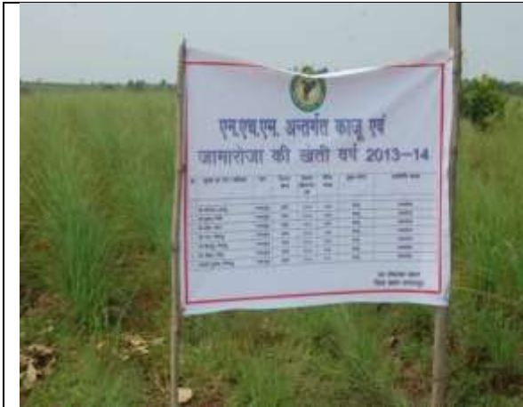
Cashew intercrop with Jamarosa