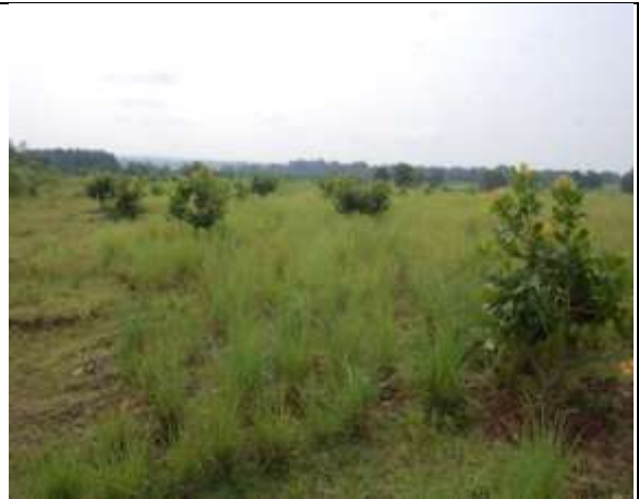
View of field